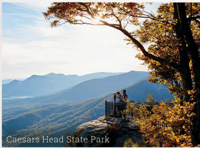
Caesars Head State Park