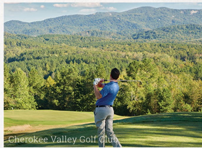
Cherokee Valley Golf Club