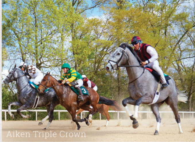
Aiken Triple Crown

There's always something new to DISCOVER in South Carolina.