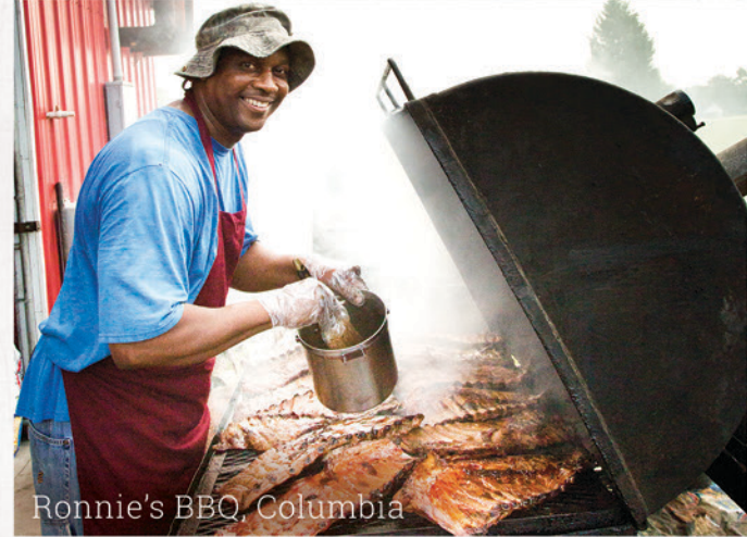
Ronnie's BBQ, Columbia

There's always something new to DISCOVER in South Carolina.