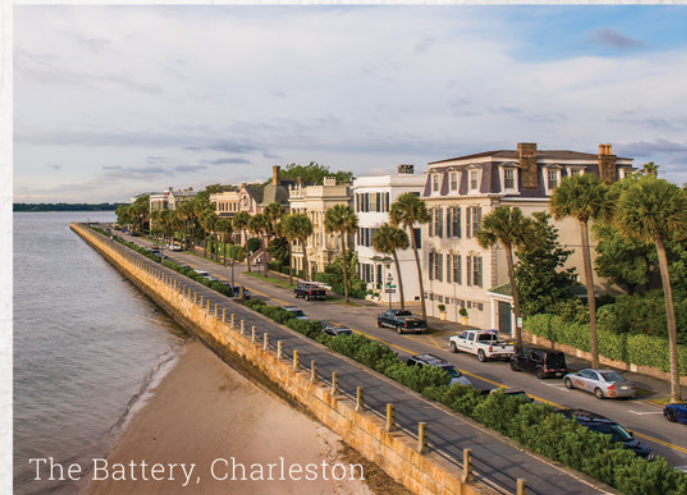
The Battery, Charleston