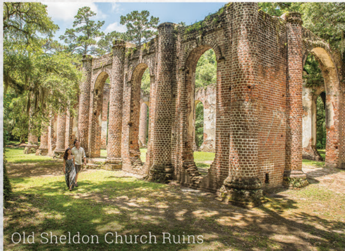
Old Sheldon Church Ruins